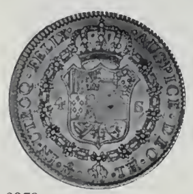
Lot No. 2379

2379 4 Escudos, 1804, 4 over 3, Mo-TH. 3rd Type. As last. C-T 199, Fr.44. A little weak in the centers. About Extremely Fine and attractive. (1,000-1,250)